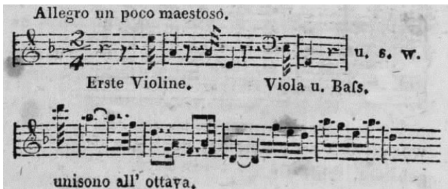
FIGURE 3. Op. 125, 1st movement, mm. 2–5, reduction of string parts, with one measure line omitted; mm. 17 (with upbeat)–21, theme as stated by the strings in unison at the octave