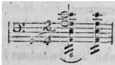
FIGURE 2. Op. 125, 1st movement, m. 1, reduction