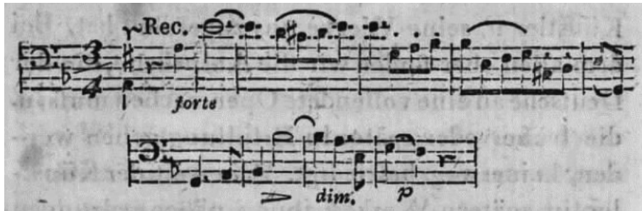
FIGURE 8. Op. 125, 4th movement, mm. 8–16, cello and bass parts

symphony rush by as interludes in this grand and broadly worked out discourse—the first, the scherzo, the Adagio—a glance backward, as though such a presentation spontaneously occurred to him as well. Finally, the melodies are heard that will soon resound from the human breast and in human speech, and are touched on joyously and continued with devotional solemnity by the instruments, self-sufficient for the last time, as the last movement of the symphony. This does not lead to a conclusion, however, but rather back to that recitative, which is now sung by the bass singer to the introductory words in similar, grand melismas that surpass the dimensions of all customary recitative—thus did it summon the development of human song from that of instruments.