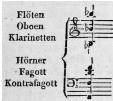
FIGURE 17. Op. 125, 4th movement, upbeat to m. 1, reduction of the wind parts

consideration the power of the individual instruments, which to Beethoven were suitable heralds. This even led him, it seems to us, into a misrepresentation. Beethoven's opening gesture is this (Figure 17),