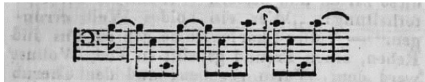
FIGURE 9. 1st movement, mm. 261–63, cello part

What shall I tell you about this ingenious, gigantic work of the still ever-growing hero of notes? It gripped us all powerfully. The very beginning, with the indeterminate dominant fifths, which the violins, along with the D horns, brought in as though from a great distance, almost like an optical illusion, is like an invocation. The first violins flash through it, along with the basses, like nerves stretched joyfully until they can no longer contain themselves, and eagerly take up the grand, noble theme in D minor. The serious first Allegro seems to us to be joy, which develops from manly power in unending activity. The emotions often take the shape of happy but important daily work (Figure 9), often of terror at the memory of past obstacles or dangers, which, however, lie underfoot (Figure 10), since, with sublime peace, our face now reflects serious clarity, through which the clarinets sing out this naive figure in firm syncopations (Figure 11).