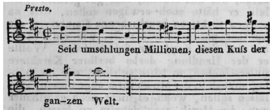
FIGURE 15. Op. 125, 4th movement, mm. 855–58, soprano part. The last note is actually a quarter note followed by a quarter rest.

indicate the abundance of the increasingly sympathetic company. At last the work rises to a Presto whose theme likewise cannot be called choice (Figure 15).