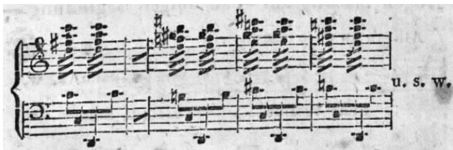
FIGURE 6. Op. 125, 1st movement, mm. 532–535, reduction

Thus far the course of a symphony, conceived in the grandest spirit, has been firmly maintained, and what we have hitherto brought up should serve only to signify it. Each of its movements brought high satisfaction, but implied an ever higher one. Man can transfer his entire soul onto the nature that surrounds him, animating it, as it were, in human terms—and nevertheless, desire for humanity inevitably penetrates him at last. The instrumental multitude is mastered, each one permeated by its own life, each one resounding with what the artist felt in his innermost soul, and now he tears himself powerfully upward through their harmony to human expression, to song. The basses take up the form of a recitative, in order to prepare the way for language itself, but only after such grand occurrences in powerful configuration, and after a mighty prelude by all the winds (see Figure 8). The principal ideas of all parts of the