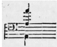
FIGURE 18. Op. 125, 4th movement, upbeat to m. 1, reduction of the trumpet and timpani

along with which trumpets and kettledrums take up (Figure 18);