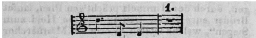
FIGURE 12. Op. 125, 2nd movement, mm. 1–2

This much seems to me to make up the first part of the symphony, which treats joy, in these three individual movements, in the most general sense. The finale, however, as the second principal part of the symphony, might be said to deal in particular with “the state of joyfulness.” Could the composer, then, instill intentions into his notes in any other way, be happy in any other way, than by describing the very way and manner in which he gives free