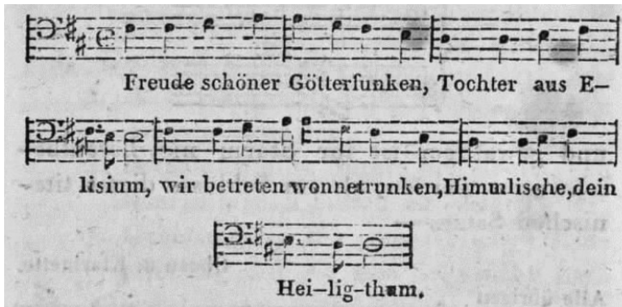
FIGURE 1. Op. 125, 4th movement, mm. 241–48, bass solo

From out of the simple sonorities of the second violins, violoncellos, horns, later also the oboes, flutes, bassoons (see Figure 2), the idea flashes forth and forms itself mightily before our eyes—to the above accompaniment (see Figure 3). For now, one can imagine how every-