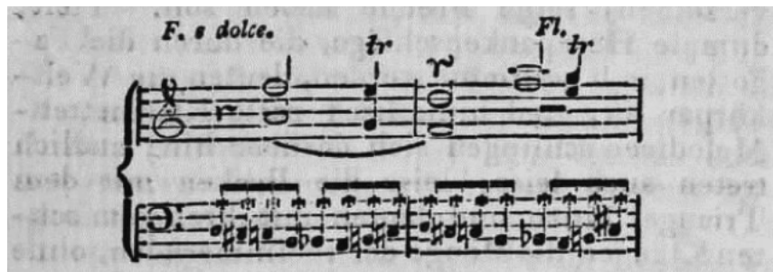
FIGURE 11. Op. 125, 1st movement, mm. 519–22, although the transcription is imprecise and two measure lines are omitted