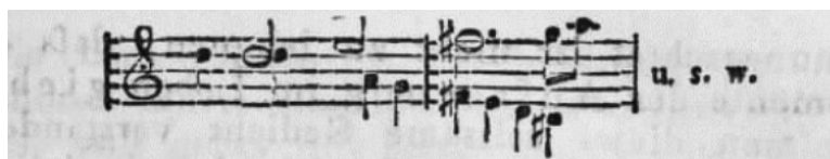
FIGURE 14. Op. 125, 2nd movement, mm. 414–20