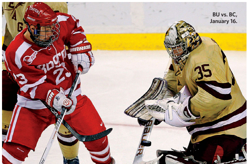
BU vs. BC, January 16.