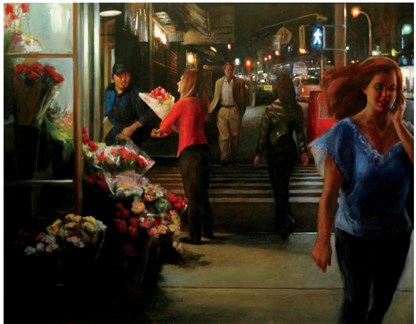
↑ Passing Glance , oil on linen, 36" x 46", 2012