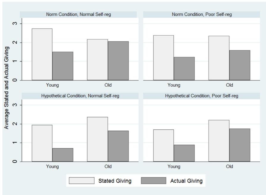
Fig. 2. Means for stated and actual donations in the Norm and Hypothetical groups by age group and by self-regulation group. Children with low Self-regulation scores are in the typical/normal half of the distribution.

Prediction 4 pertained to the Norm condition only. Comparing the Normal and Poor self-regulation groups by age revealed that older children in the Normal group had smaller Difference Scores, as predicted. Older children in the Normal Self-regulation group both gave more (Mann–Whitney test, p < 0.01 ) and gave closer to the stated amount (Mann–Whitney test, p = 0.011 ) compared to older children in the Poor Self-regulation group (stated donations did not differ, Mann–Whitney test, p = 0.213 ). For younger children, self-regulation level did not influence children’s ability to give amounts closer to the stated amount (for Difference Score comparison, Mann–Whitney test, p = 0.598 ). To summarize, with age, children with normal self-regulation skills closed the gap between what they said they should give and what they actually gave, but children with poorer self-regulation did not (Fig. 2). This change was driven by higher actual giving among older children with normal self-regulation.