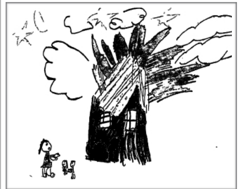
“A Storybook of Civil War,” Northeast , May 31, 1987. Child’s drawing of home burned by Guatemalan soldiers.

In the 1980s, New England became an important node in the Sanctuary Movement. Churches and synagogues moved families from El Salvador and Guatemala to the area not only to provide them safety, but also that the refugees might act as witnesses to the brutality and injustice of US-sponsored dictators. Often living in the basements of local houses of worship, these “missionaries,” as they were sometimes called, were specially selected and prepared for the arduous task of converting the American political imagination. With support from congregations, asylum-seekers addressed a variety of audiences about the human toll of the Cold War. Under the direction of Rady Roldan-Figueroa, the Center for Global Christianity & Mission is documenting and analyzing the regional networks that collaborated in the Sanctuary Movement. Findings will be made available in both print and digital formats. The Sanctuary Movement was one way mainline congregations reimagined mission in the post-colonial age.