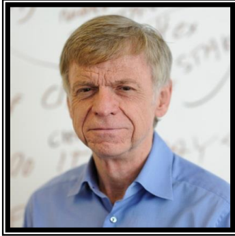
John P. Kotter Director of Research at Kotter International, Professor Emeritus at Harvard Business School

Regarded by many as the authority on leadership and change, John P. Kotter is a New York Times best-selling author, award winning business and management thought leader, business entrepreneur, inspirational speaker and Harvard Professor. His ideas, books, speeches, and company, Kotter International, have helped mobilize people around the world to better lead organizations, and their own lives, in an era of increasingly rapid change.