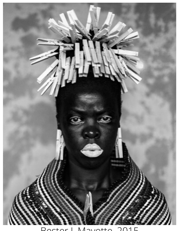
Bester I, Mayotte, 2015