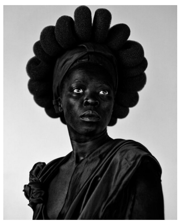
Ntozakhe II, Parktown, 2016