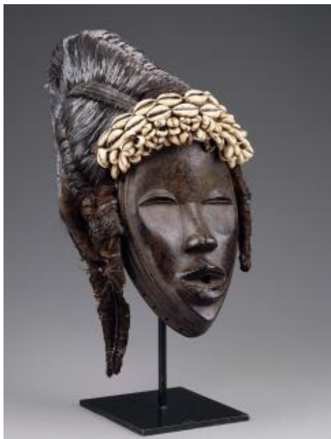
Mask (deangle); Dan, 20th century; Liberia, Cote d'Ivoire