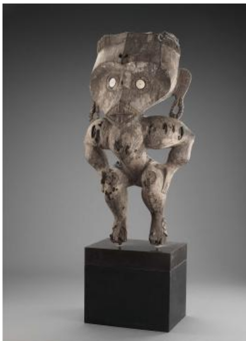
Dayak figure; Dayak, northeastern Borneo mid 18th–19th century