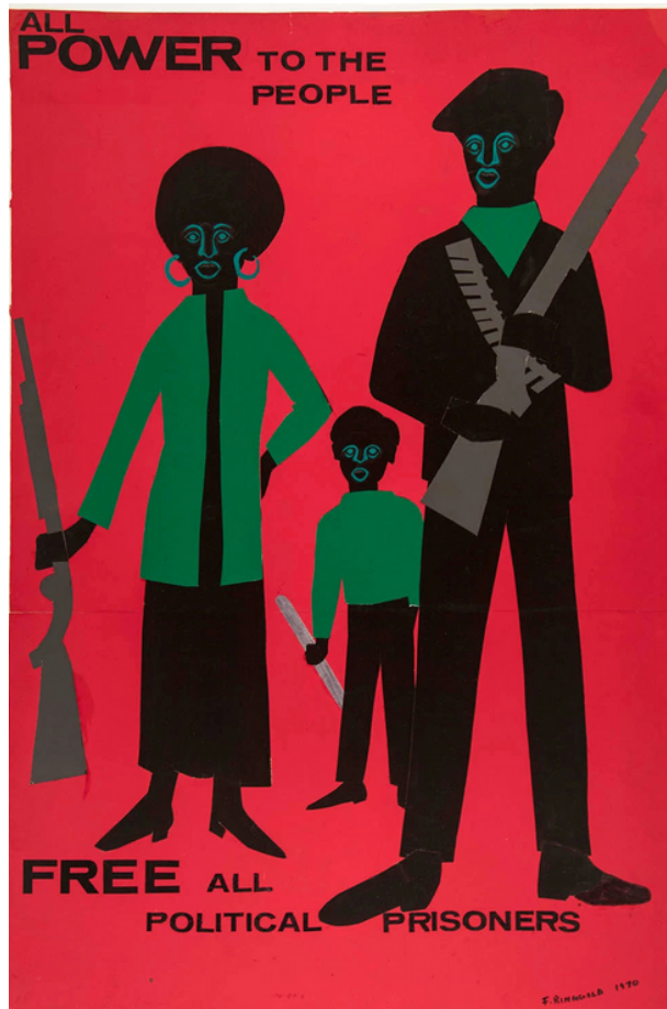
Ms. Ringgold's "All Power to the People" (1970), from cut paper.