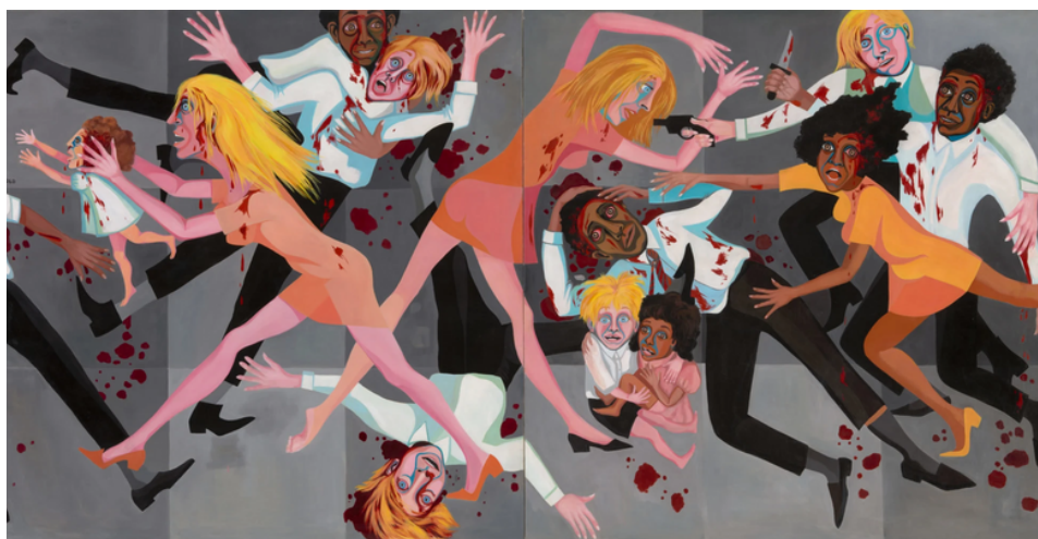
Faith Ringgold's "American People Series #20: Die," from 1967, was a centerpiece of the MoMA rehang last fall