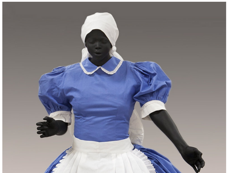
Mary Sibande, Sophie-Merica , 2009

The exhibition addresses three general themes—gender, politics, and historical narratives. We examine how the gendered spaces created by the artists engage issues of race and gender as they play out in the history of representation. These images contest racial essentialism and challenge expectations as well as longstanding ideas related to gender norms. Images of the political body reveal anxieties of being and belonging, allegories of liberty, and the ironies of citizenship in a nation fraught with racial tension. By considering historical narratives, we present works in which contemporary identities and histories collide.