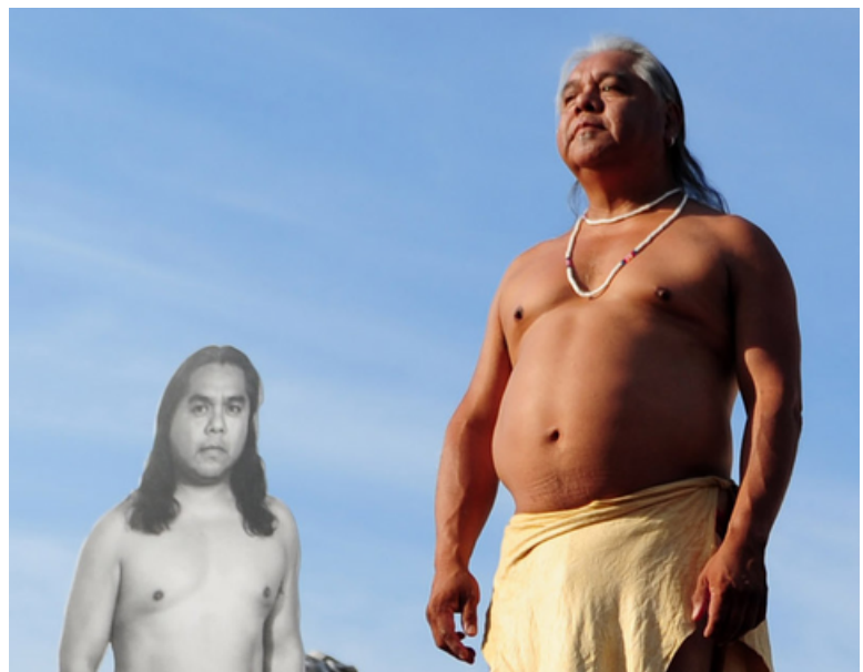
James Luna, Take a Picture With a Real Indian , 2010