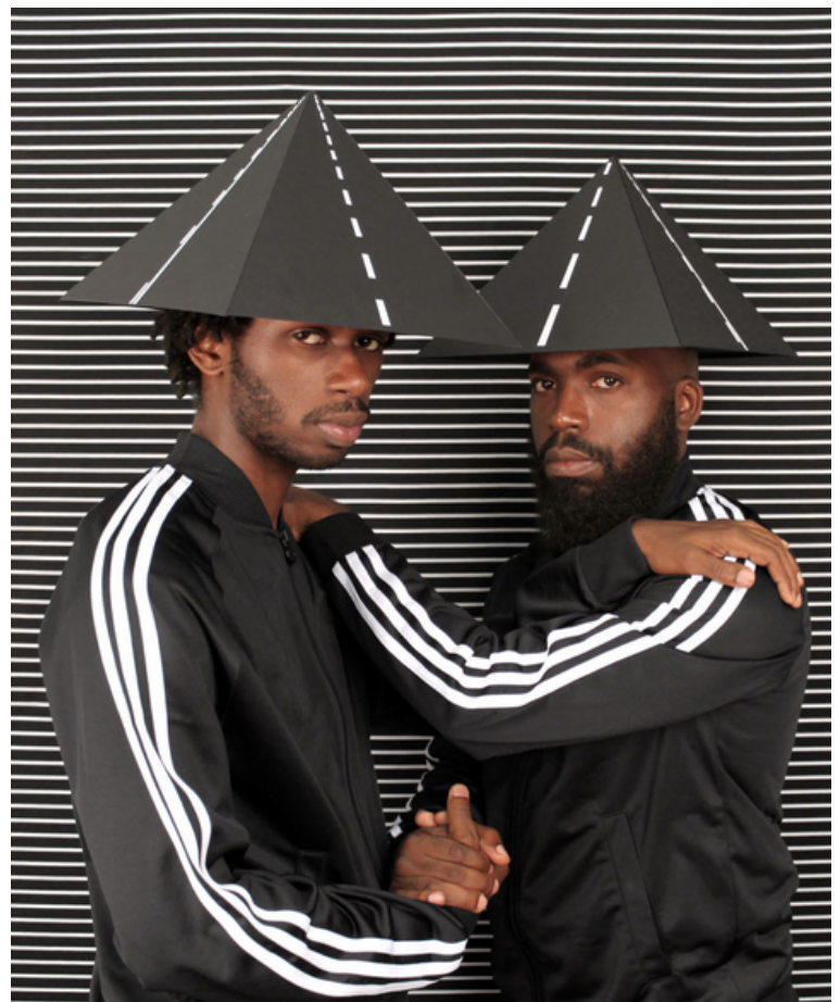
Crossroads. 2012.(Digital photograph) 44 in. x 36 in. Edition of 3 + 2 APs.

HOW MARDI GRAS INDIANS REBEL AGAINST HISTORY