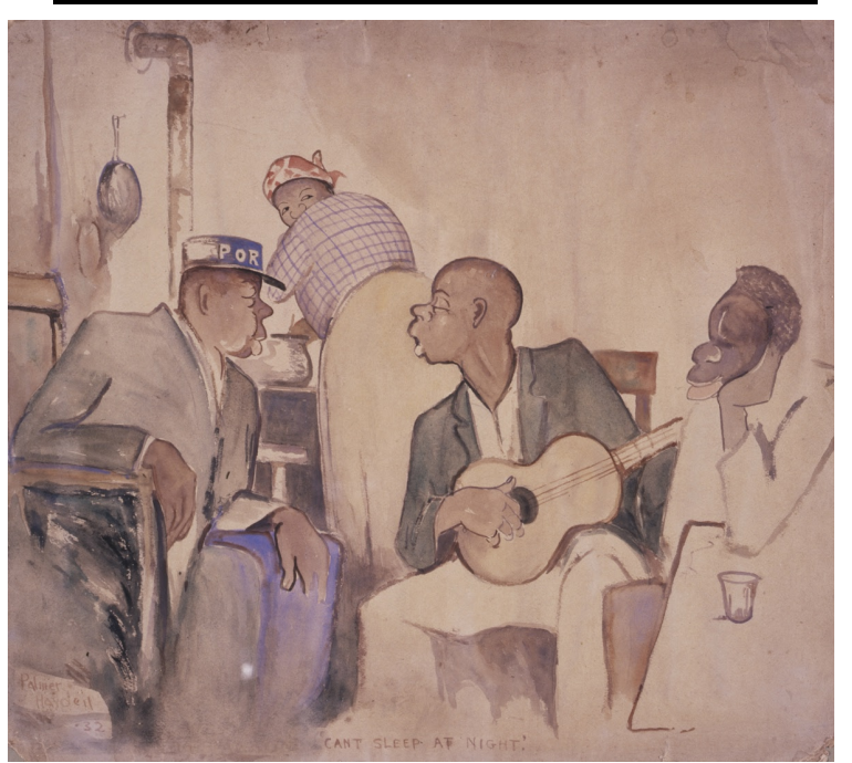
Can't Sleep at Night (1932), by Palmer C. Hayden