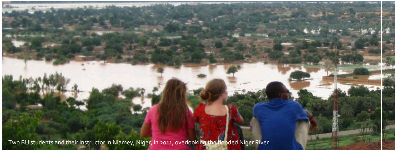
Two BU students and their instructor in Niamey, Niger, in 2011, overlooking the flooded Niger River.

Radio stations like the BBC, Radio France Internationale, China Radio International, Voice of Russia, Voice of America, Deutsche Welle, and IRIB all broadcast in Hausa.