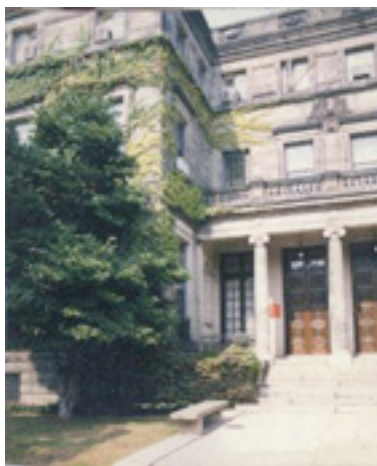
African Studies Center, 125 Bay State Road, 1982-1984