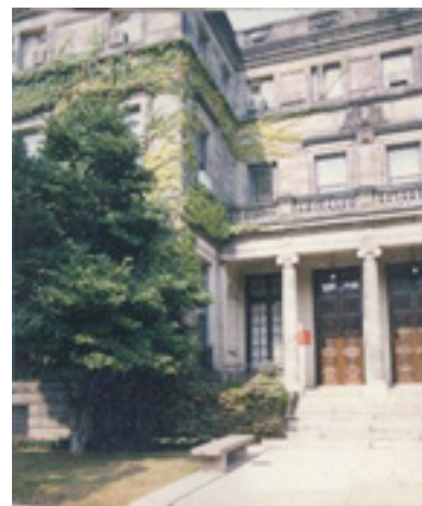
African Studies Center, 270 Bay State Road, 1984-present

Note: This sketch of the ASC's institutional history is a draft and, of course, needs comments and corrections by alumni, friends, and critics. An obvious need is to link the developments in African studies at Boston University to the sweep of events and processes in Africa and Africa's meaning in the American context. That is a much larger project of research and reflection that I hope this current exercise will stimulate. To that end I hope others will contribute documents, memorabilia, notes, etc. to the ASC to allow us to establish an ASC institutional history collection at the African Studies Library.