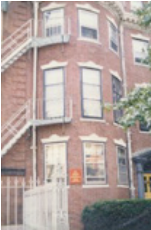
African Studies Center 154 Bay State Road, mid-1950s