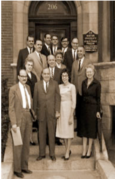
State Dept. Officer trainees in front of the 206 Bay State Road office, c.1959.