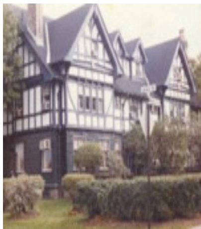
African Studies Center, 10 Lenox St., 1966-1982

The new space includes new carpets, newly appointed seminar rooms, faculty offices, built-in state of the art media equipment, an Outreach Library, kitchen, lounge, and sunlit interior hallways. Our main William O. Brown seminar room holds 45 people and includes the familiar New Hampshire hand-made cherry seminar table, a LCD projector, maps and chalkboard. Around the new ASC there are familiar objets d'arte, cloth, colloquy seating areas, bulletin boards, a kitchen, a lounge, a graduate student office, and lots of natural light. Over the first few months the ASC community itself will find places to meet, have lunch, discuss, and share information about teaching, events in Africa, and common interests. The new space will bring us together in familiar ways, but also perhaps in some new places with new people in the new academic year. The Condition already feels permanent.