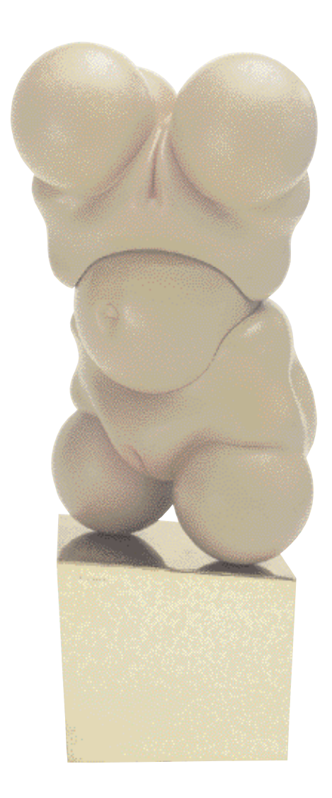
Fig. 4 Hans Bellmer, Doll 1936. Painted aluminum cast 1965. 19^{1/8} \times 10^{5/8} \times 14^{7/8} in.; bronze base, 7^{1/2} \times 8 \times 8 in. Museum of Modern Art, NY. The Sidney and Harriet Janis Collection.