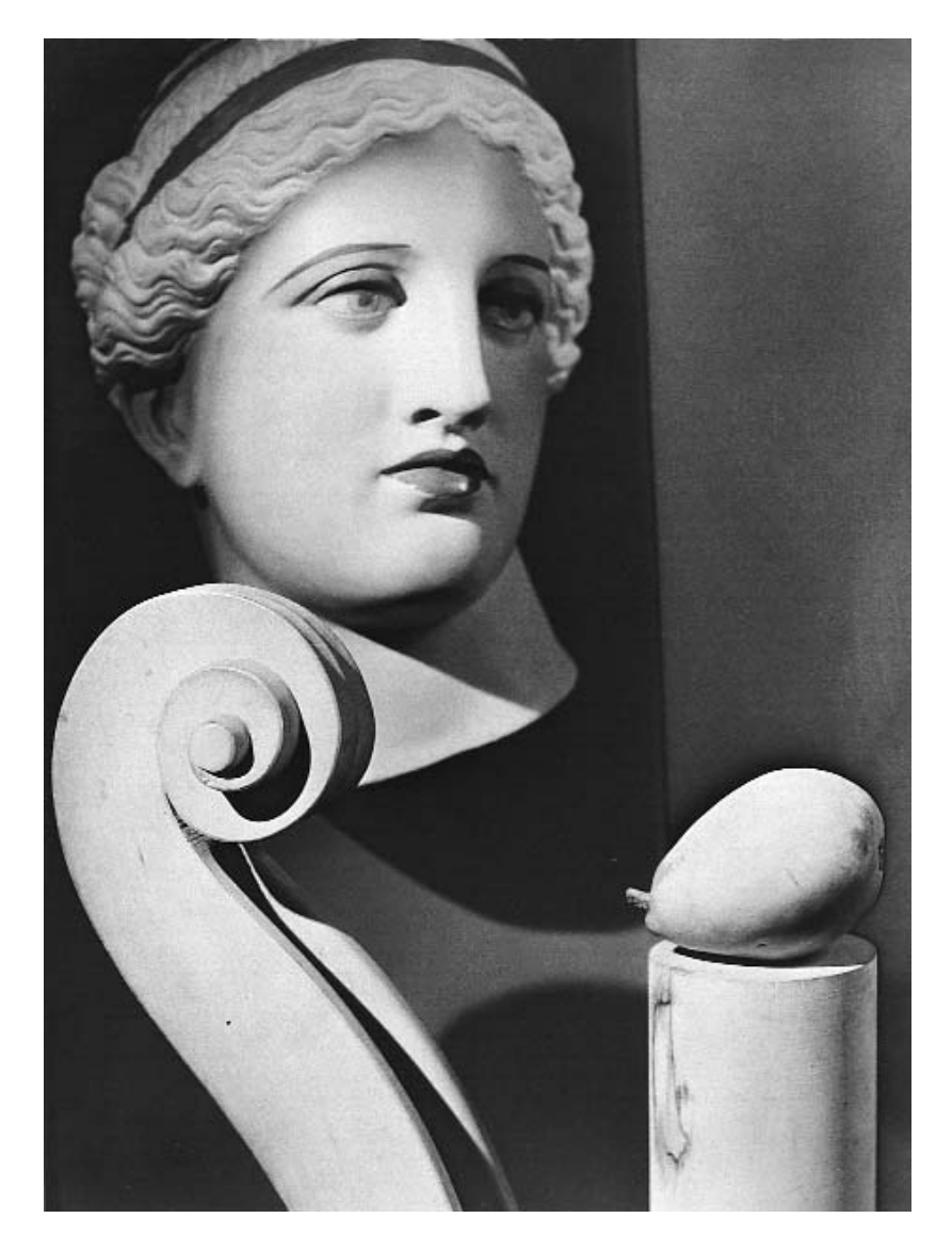
Fig. 5 Man Ray, En pleine occultation de Venus . Paris, France.