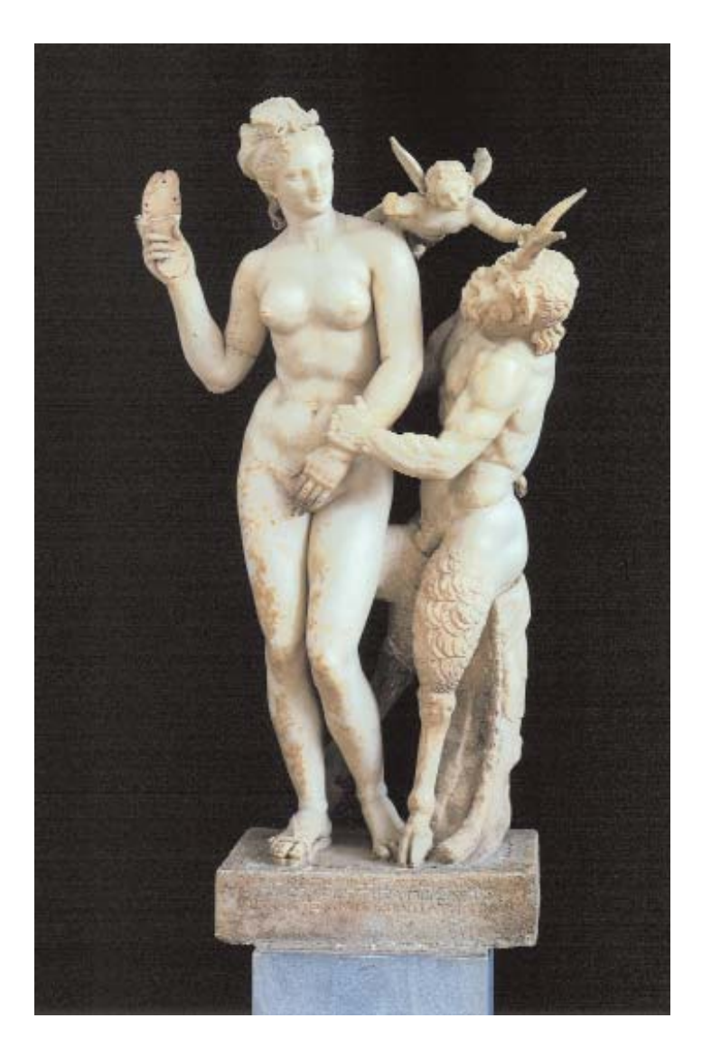
Fig. 2 Aphrodite, Pan, and Eros. National Archeological Museum, Athens, Greece.