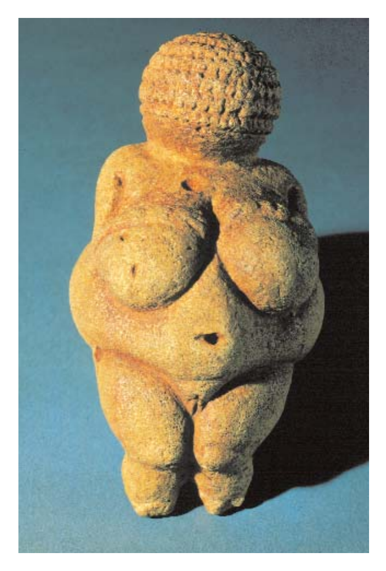
Fig. 3 Venus of Willendorf. Limestone figure (front view), 25th millenium BCE. Naturhistorisches Meseum, Vienna, Austria.