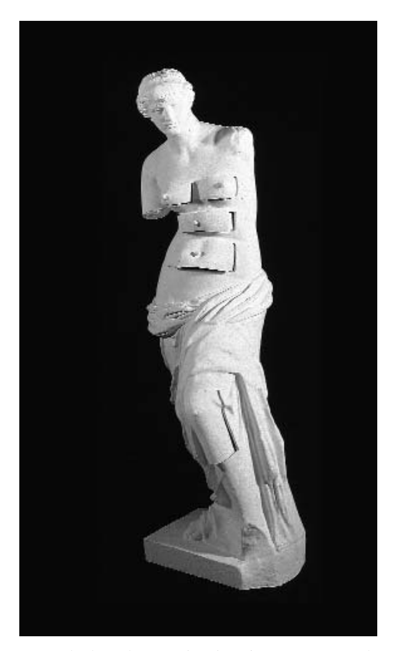
Fig. 6 Salvador Dalí, Venus de Milo with Drawers 1964. Dalí Theater-Museum, Figueres, Spain. Replica of original work from 1936, bronze with plaster, 98 x 32.5 x 34 cm. (© 2002 Salvador Dalí, Gala-Salvador Dalí Foundation / Artist Rights Society [ARS], NY)