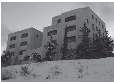
ACOR in the snow on February 1, 2008