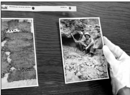
Photographs are placed in protective enclosures

The physical arrangement of a collection can only happen after the intellectual arrangement has been determined. In this phase, materials are organized into folders that correspond to the folder list and preservation measures are taken. All documents are enclosed in acid-free folders. Photographs and negatives are separated from paper materials and enclosed in chemically-inert polypropylene sleeves. Additional preservation