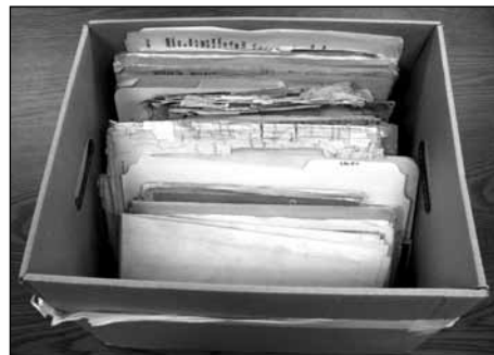
A box of Unprocessed Materials