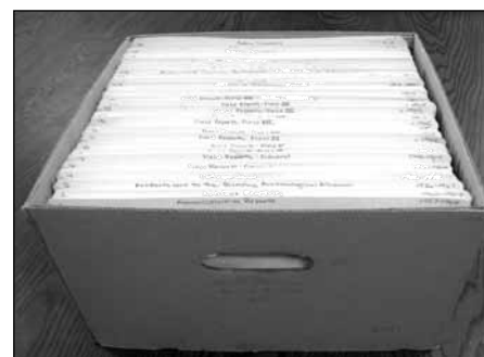
A box of processed materials.

measures include cleaning surface grime, removing metal fasteners, and preservation photocopying of extremely acidic items. If left in contact with other documents, the acid from materials like old newsprint and rust from metal fasteners can eventually eat through other items in a folder. Enclosed materials are organized in acid-free archival manuscript boxes and shelved in a dark storage room.