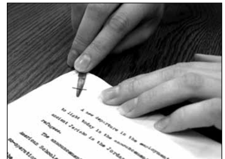
Metal fasteners are removed from a piece of correspondence using a microspatula