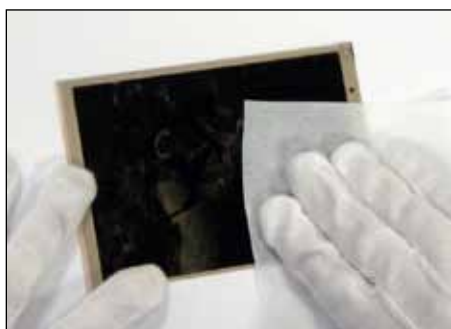
Photographs and negatives are cleaned utilizing conservation materials.