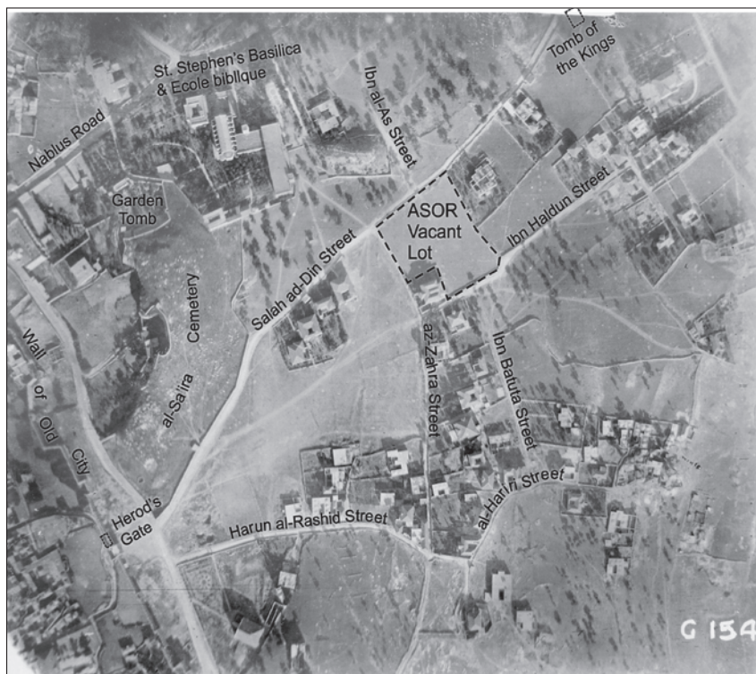
The eastern region of Jerusalem taken by a Royal Flying Corps pilot on 26 June 1917. The future home of ASOR, now the Albright Institute, is a vacant lot near the center of the photograph.

The most obvious structure in the RFC photograph is St. Stephen's Basilica, or the École Biblique as we know it today. The walls of the Old City are barely visible on the photograph's edge, but the roads running away from Damascus Gate and Herod's Gate are clear. The main road north, the Nablus Road, appears in front of St. Stephen's Basilica going north from Damascus Gate. The other road, leaving Herod's Gate, is Salah ad-Din Street. az-Zahra Street branches off from Salah ad-Din Street, and at this junction we see ASOR's vacant lot, barren. It is here, in a suburban but almost rural area, ASOR decided to build its school. Farther down Salah ad-Din Street, at the edge of the photograph is the Tomb of the Kings, where de Saulcy excavated in the mid-nineteenth century. How different it all looks now. ❀