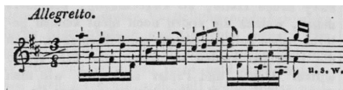
FIGURE 9. Op. 137, mm. 1–5, single-staff reduction.

We have nothing further to add to the title than that this fugue by the master is not long, is well worked out, and, as can almost be taken for granted, not easy to perform two-handed. Like all sound fugues, it demands study so that all voices can be brought out appropriately. The theme is short and as follows: