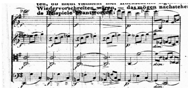
FIGURE 1. Op. 127, 1st movement, mm. 107–117