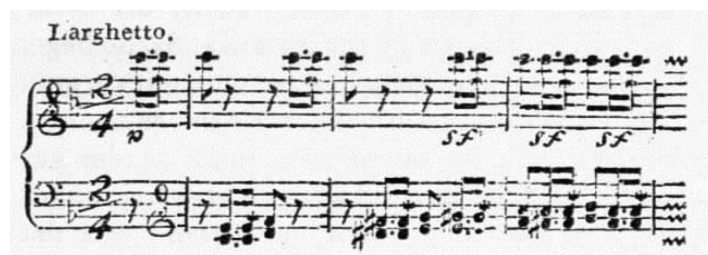
FIGURE II. WoO 129, mm. 1–3.

A small but splendid piece of music—whatever opponents of musical painting may say. This Gothic genre is all the more appropriate here since the poet himself has toyed so attractively with the imitation of the quail’s song (“fürchte Gott”—“liebe Gott”—“lobe Gott” and so forth). B. was able to interpret this and develop it even further. His music, without becoming the slightest bit comic or commonplace, is almost entirely built upon the figure imitating the quail’s song, as it is stated right in the short introduction: