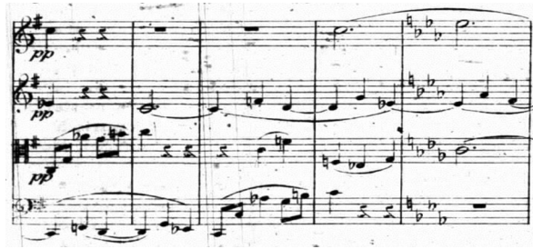
FIGURE 1. (cont'd.)

Now it is unnecessary, considering the aforementioned general recognition already publicly accorded to the work in question, to say even more about it here, or perhaps to enumerate details from it, which can always give only a completely inadequate idea of the whole, whose value in just this instance lies primarily in the totality of the outpouring, —or perhaps to give a dry anatomical description of the framework of the whole, and, according to customary review procedure, to enumerate fully that it modulates into X major for so and so many measures, going from there by means of the Y chord into Z minor, in 4/4 meter, here pianissimo , there forte , etc. etc.—from all of which nobody can form a conception of the essence of the