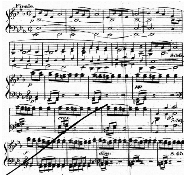
FIGURE 2. Op. 127, 4th movement, mm. 5–13, 90–97, and 248–53, reduction to two staves