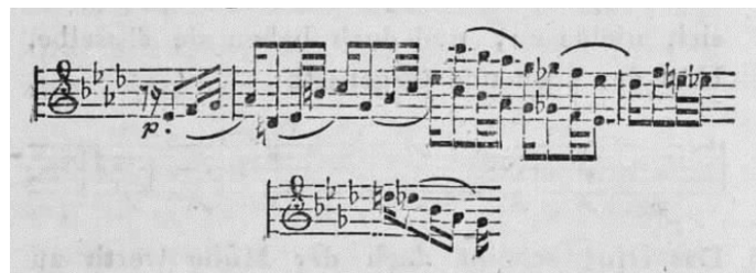
FIGURE 3. Op. 127, 2nd movement, mm. 39–41, slightly inaccurate combination of the first and second violin parts