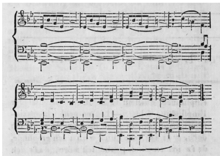
FIGURE 4. Op. 127, 4th movement, mm. 5–12, reduction to two staves with added double bar at the end

How did that cadence go, quite unusually animated. —So gigantic. —And an unusual finale theme: