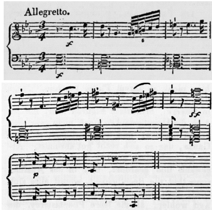
FIGURE 10. WoO 80, mm. 1–8, with added double bar at the end

B. follows in this little work the oldest, specifically old German, manner of writing variations more than what is now customary. 2 Händel, in particular, worked out variations in this genre, only, to be sure, with a degree of imagination far less free and easily moved, but also less rambling. With this procedure B. knew how to give even this small product an attractive charm of the unexpected. He takes this short, most simple theme: