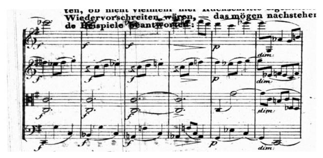
FIGURE 1. Op. 127, 1st movement, mm. 107–117