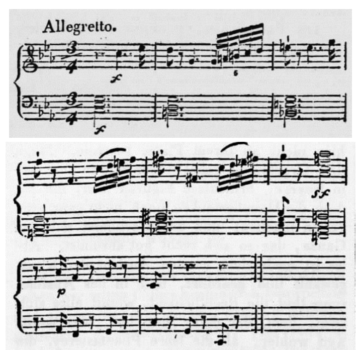
FIGURE 10. WoO 80, mm. 1-8, with added double bar at the end

Botions more than what is now customary. Händel, in particular, worked out variations in this genre, only, to be sure, with a degree of imagination far less free and easily moved, but also less rambling. With this procedure B. knew how to give even this small product an attractive charm of the unexpected. He takes this short, most simple theme: