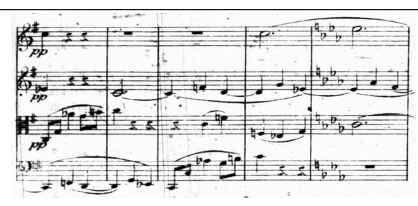
FIGURE 1. (cont'd.)

Now it is unnecessary, considering the aforementioned general recognition already publicly accorded to the work in question, to say even more about it here, or perhaps to enumerate details from it, which can always give only a completely inadequate idea of the whole, whose value in just this instance lies primarily in the totality of the outpouring, —or perhaps to give a dry anatomical description of the framework of the whole, and, according to customary review procedure, to enumerate fully that it modulates into X major for so and so many measures, going from there by means of the Y chord into Z minor, in 4/4 meter, here pianissimo , there forte , etc. etc.—from all of which nobody can form a conception of the essence of the