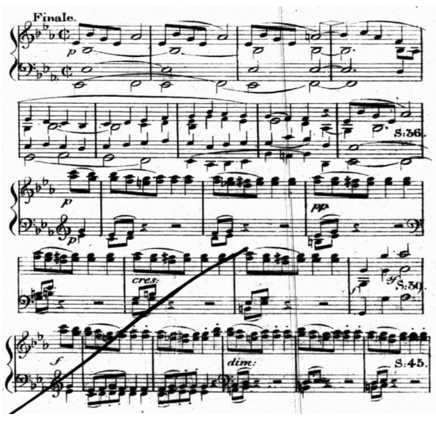
FIGURE 2. Op. 127, 4th movement, mm. 5-13, 90-97, and 248-53, reduction to two staves