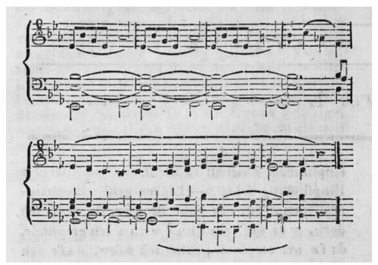
FIGURE 4. Op. 127, 4th movement, mm. 5–12, reduction to two staves with added double bar at the end and it seems to be capably worked out, how inevitably do the voices flow, as though it were nothing, and yet there they are. And the knocking countersubject:

How did that cadence go, quite unusually animated. —So gigantic. —And an unusual finale theme: