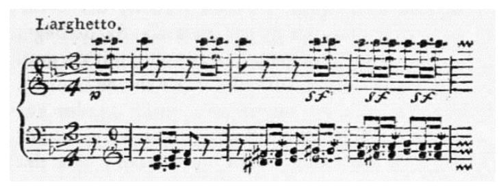
FIGURE 11. WoO 129, mm. 1-3.

A small but splendid piece of music—whatever opponents of musical painting may say. This Gothic genre is all the more appropriate here since the poet himself has toyed so attractively with the imitation of the quail's song ("fürchte Gott"—"liebe Gott"—"lobe Gott" and so forth). B. was able to interpret this and develop it even further. His music, without becoming the slightest bit comic or commonplace, is almost entirely built upon the figure imitating the quail's song, as it is stated right in the short introduction: