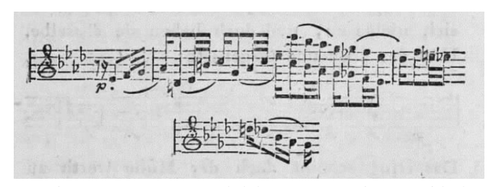
FIGURE 3. Op. 127, 2nd movement, mm. 39–41, slightly inaccurate combination of the first and second violin parts