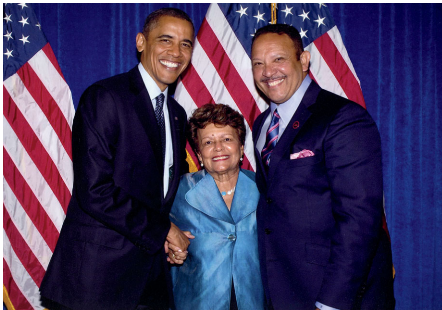
Morial with President Barack Obama and her son Marc Morial.

Morial is “saddened by the racial attitudes that exist today.” On some levels, she says, blacks are fighting the same battles they did in Dutch’s day. “We have a history of police brutality—my husband faced that as a legislator and head of the NAACP—and it was white cops against black people, and that’s resurfacing.” Blacks continue to face overt as well as