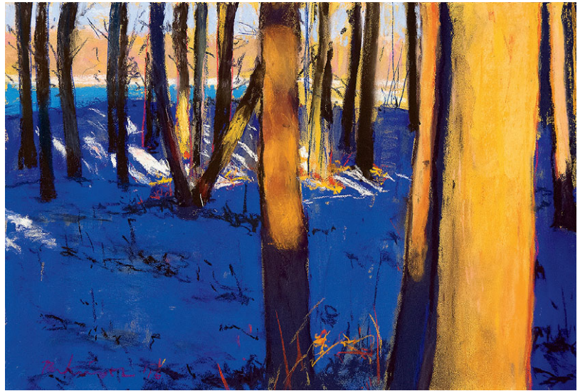
↑ Forest in Winter , pastel, 13" x 19", 2016

ROY PERKINSON (GRS’70) writes that Clouds over Frenchman Bay captures a late afternoon view from the summit of Cadillac Mountain in Acadia National Park, Maine, looking northward across Frenchman Bay. The Porcupine Islands are seen in the middle distance. Forest in Winter shows a snow-covered forest in Framingham, Mass., with the nearby Farm Pond visible through the trees. Both paintings can be seen at Powers Gallery ( www.powersgallery.com ) in Acton, Mass. Learn more about Perkinson’s work at www.royperkinson.com .