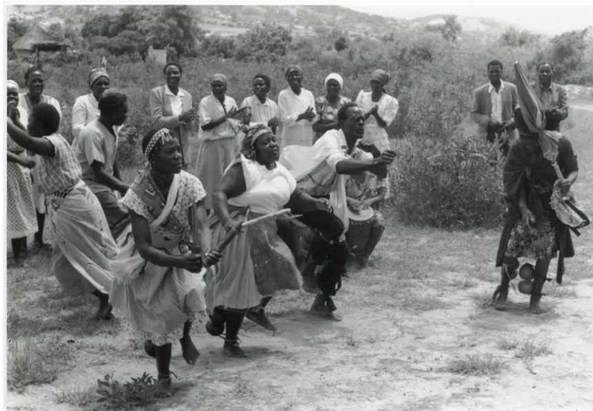
AIC members in Zimbabwe dance as a form of worship. This photo and many others will be included in the upcoming AIC Photo Archive.

As a guiding theme for this academic year, the Center for Global Christianity and Missions has asked the following question: what is world Christianity? On our website and in our last issue, scholars associated with the CGCM provided a wide array of thought provoking answers to our thematic question. While we began the year thinking at the global level, we now set our sights on decidedly more local aspects of the bigger picture. This semester, the CGCM will be enthusiastically hosting the Global Christianity Speakers Series that will include academics who study specific topics in world Christianity—ranging from Orthodoxy, Roman