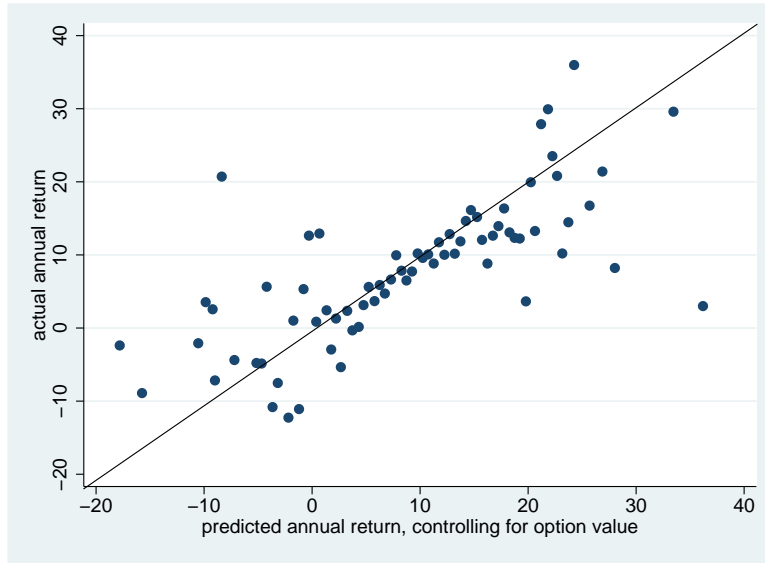
Figure 3: Predicted versus realized returns. Predicted returns include the option value of entering new countries.

option value to improve the fit of the model. It is clear from looking at the two graphs that controlling for the option value improves the risk premium estimates.