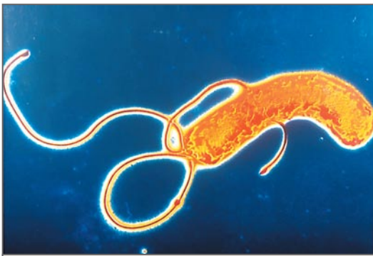
Figure 1. Helicobacter pylori .

H. pylori is a gram-negative bacterium with a helical rod shape. It has prominent flagellae, facilitating its penetration of the thick mucous layer in the stomach.