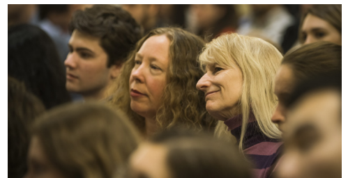
Audience at the GDP Center inaugural event at Boston University.