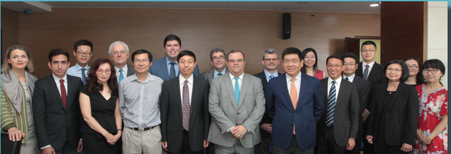
Workshop hosted by Boston University's Global Development Policy (GDP) Center, the United Nations Conference on Trade and Development (UNCTAD) and the Institute of World Economics and Politics (IWEP) at the Chinese Academy of Social Sciences (CASS) in support of the T-20 Task Force on 'An International Financial Architecture for Stability and Development.'