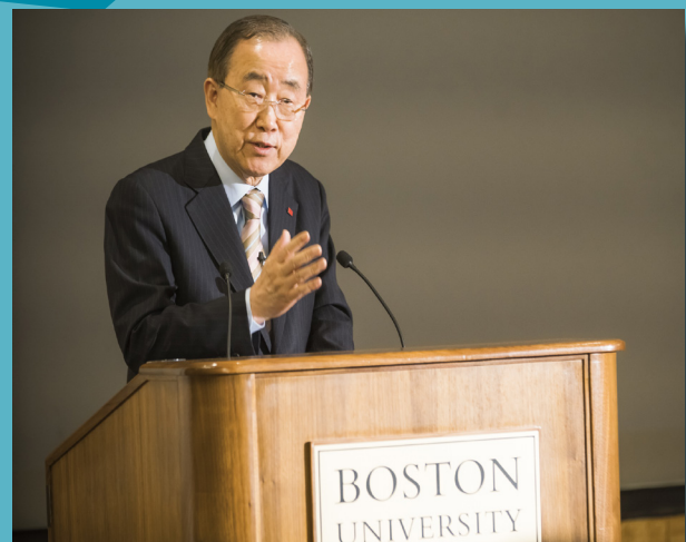
Ban Ki-moon, eighth Secretary-General of the United Nations, speaking at the GDP Center inaugural event at Boston University.