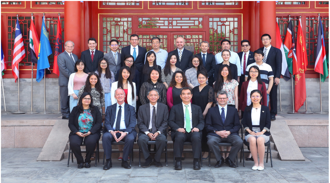
The GDP Center co-hosted the 23rd New Structural Economics (NSE) International Development Forum in Beijing, China with colleagues at the Institute of New Structural Economics at Peking University.