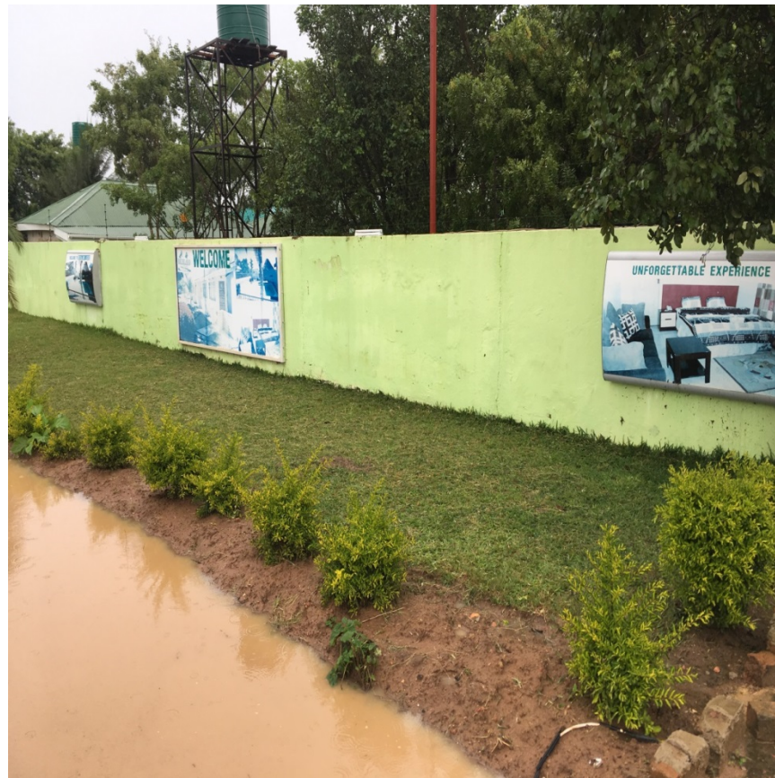
Richland Lodge in Choma