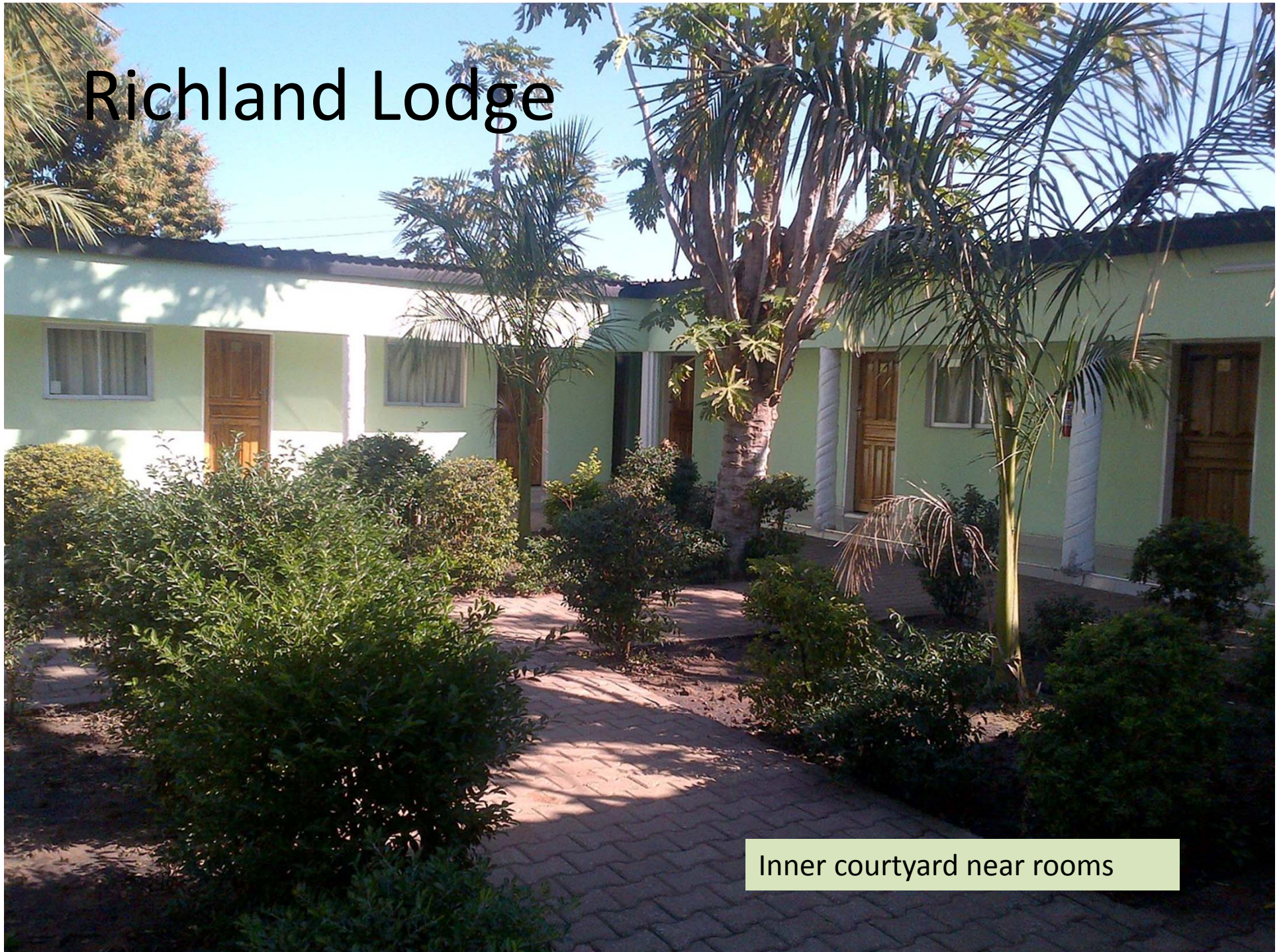
Inner courtyard near rooms