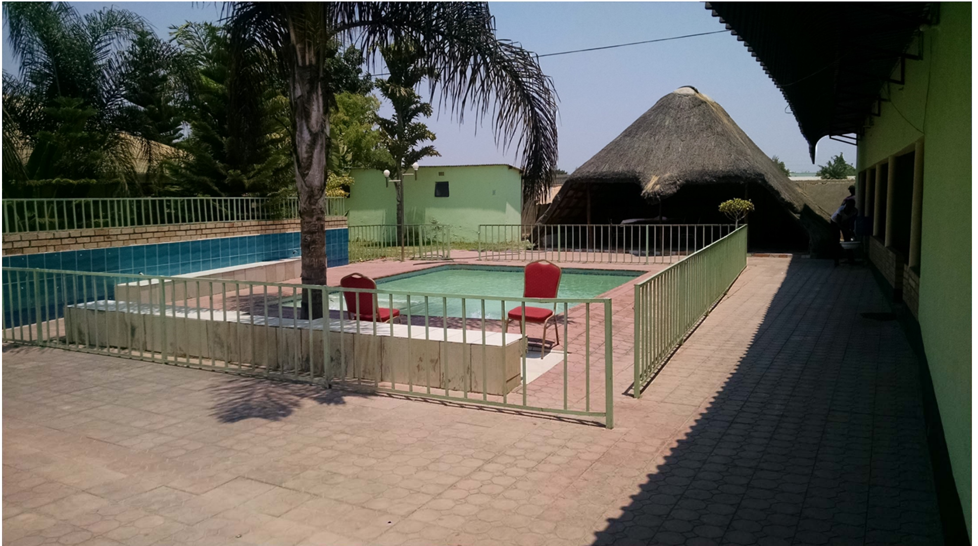
Inner courtyard near dining room, with small dipping pool