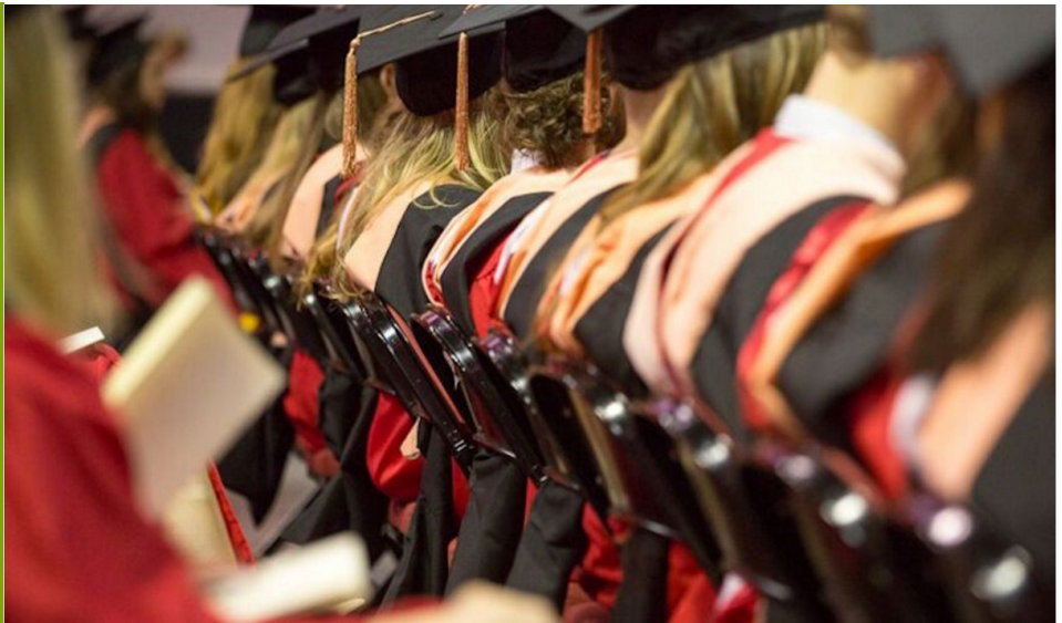
SPH Commencement 2016