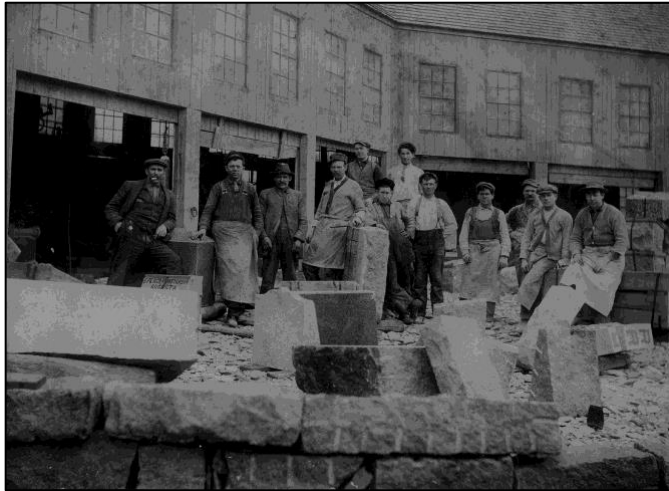
Quincy Quarry & Granite Workers (Quincy Quarry & Granite Museum)