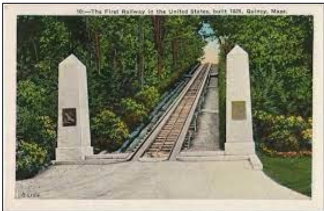
Gridley Bryant's First Granite railroad