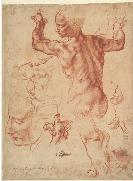
Figure 2. Michelangelo Buonarroti, Studies for the Libyan Sibyl (recto) , c. 1510-11, red chalk and white chalk, The Metropolitan Museum of Art, New York.