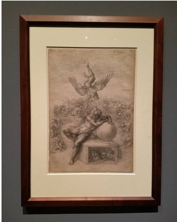
Figure 1. Michelangelo Buonarroti, Il Sogno (The Dream), c. 1533, black chalk on laid paper, The Courtauld Institute of Art, London.